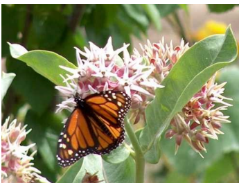
Monarch Butterfly on Milkweed