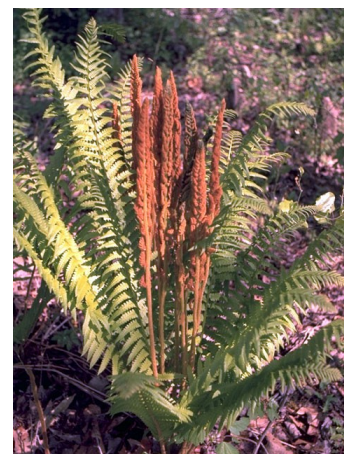
Cinnamon Fern