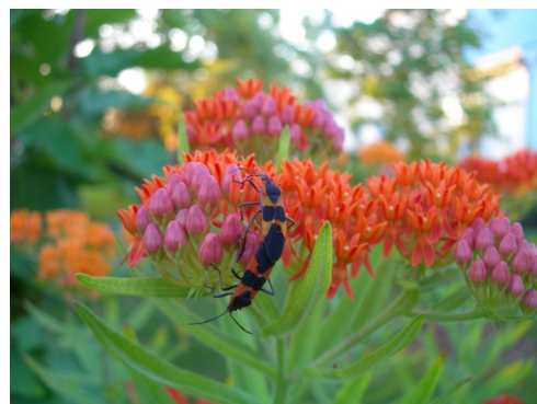
"Milkweed bug finds a home" One of the photo contest entries.

National headquarters is calling all Wild Ones members. The photos are in for this year's Wild Ones Photo Contest. Come and view the photos – they are beautiful! Narrow your choices down to the one you think is best. Then cast your vote. Don't wait too long – all votes must be in by October 29. To view photos click here – you will be asked to type in your member email address and a password to access the photos and be able to vote: http://www.wildones.org/members/photo.cgi