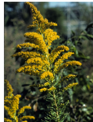
Tall Goldenrod