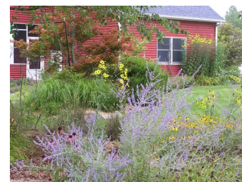
The Osgood's Side Yard.