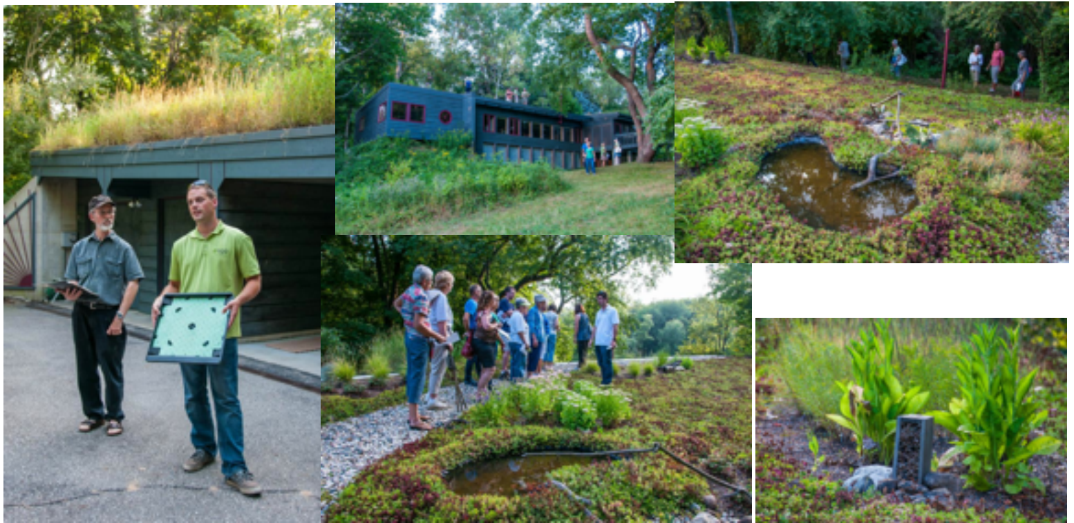
Tom Newhouse (L) with Erik Cronk (R), Tom’s green roof includes many natives along with a pond and native bee houses!

Last year’s installation was the first renovation of the roof since Tom built the house in the 1970s – with a green roof. Green roofs are noted for filtering rain water, preventing runoff and reducing the “heat island effect” in cities. In this case, the five-year-old AGA is experimenting with native plants to see if the benefits can include habitat and food for wildlife.