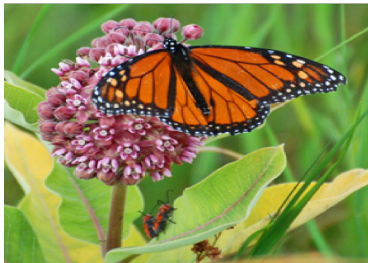
Monarch and milkweed beetles on common milkweed

you can also check out the websites at www.monarchjointventure.org or www.monarchwatch.org to find information on way stations, seed collection and sowing methods and milkweed species. You can also plan to attend our Feb. 18th program featuring the film Flight of the Monarchs to learn more about these fascinating pollinators!