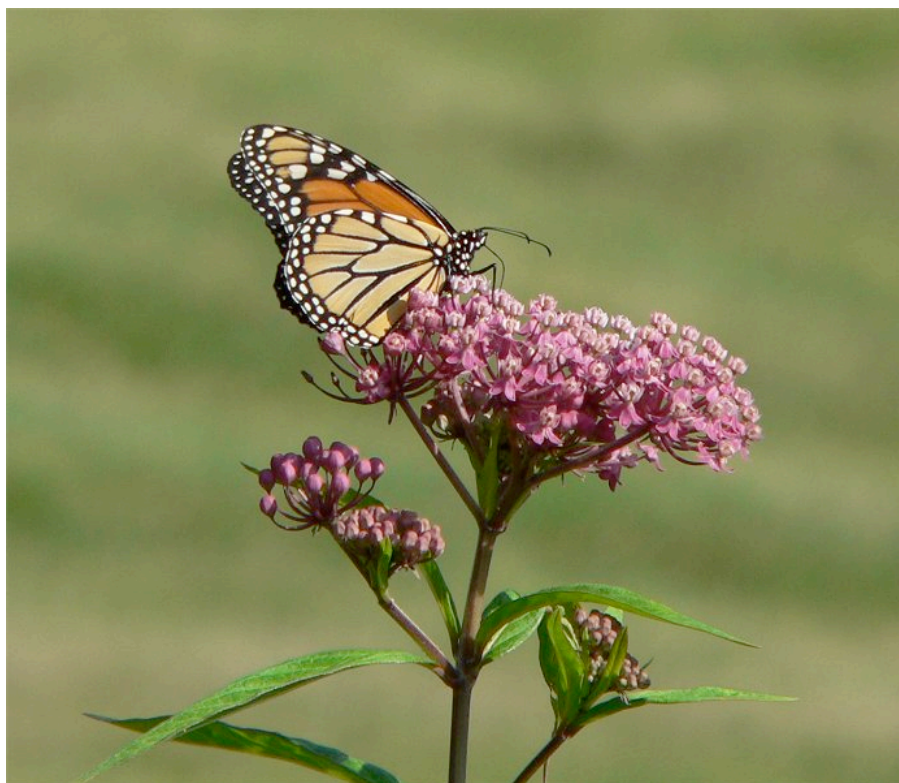
Monarch on Swamp Milkweed

CREATE, CONSERVE, & PROTECT MONARCH HABITATS