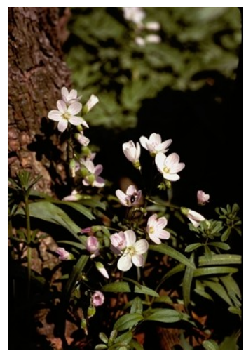
Claytonia virginica, also known as Spring Beauty