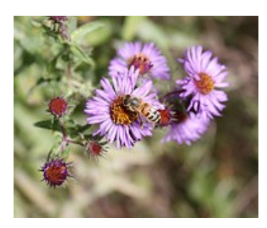
Photo - Honey bee on New England Aster, aster novae angliae - was donated by Kelly N Rice who is a member of River City Wild Ones in Grand Rapids, MI - an organization dedicated to preserving, protecting and promoting native plants and natural landscapes. Many members of Wild Ones have donated photos to the "Photos of Plants Good for Bees" project.

A website, <u>www.NetworkBees.com</u>, that is dedicated to helping bees has started a project called Photos of Plants Good for Bees. Here is a link: <a href="http://www.networkbees.com/photos.of">http://www.networkbees.com/photos.of</a> plants for bees.html