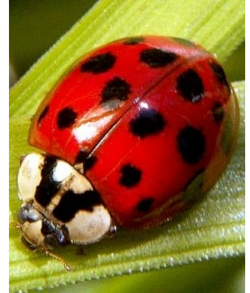
The lovely ladybug