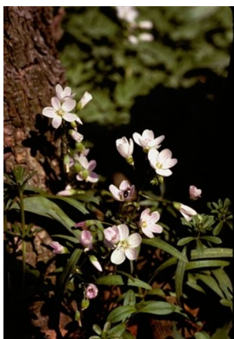
Claytonia virginica, also known as Spring Beauty

We received this informative email regarding a pollinator monitoring program for the Spring Beauty. This seems like a pleasant, useful and time-limited project. Both species of Spring beauty grow in Michigan: Claytonia virginica in the southern counties, and C. caroliniana in the northern L.P. and U.P.