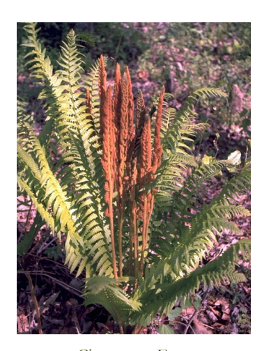
Cinnamon Fern