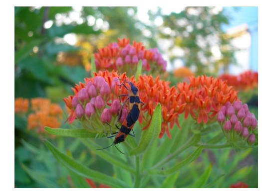
"Milkweed bug finds a home" One of the photo contest entries.

National headquarters is calling all Wild Ones members. The photos are in for this year's Wild Ones Photo Contest. Come and view the photos – they are beautiful! Narrow your choices down to the one you think is best. Then cast your vote. Don't wait too long – all votes must be in by October 29. To view photos click here – you will be asked to type in your member email address and a password to access the photos and be able to vote: <a href="http://www.wildones.org/members/photo.cgi">http://www.wildones.org/members/photo.cgi</a>