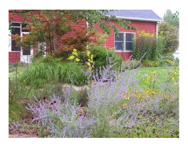
The Osgood's Side Yard.