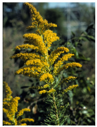
Tall Goldenrod