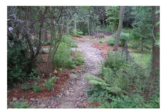
Woodland path in the Osgood Garden.

Our first year of Look & Learn tours has been declared a success by those who attended. We toured three wonderful, distinctive gardens that presented a great opportunity to exchange information.