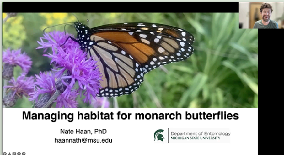
Managing habitat for monarch butterflies