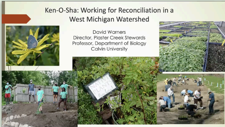
Ken-O-Sha: Working for Reconciliation in a West Michigan Watershed